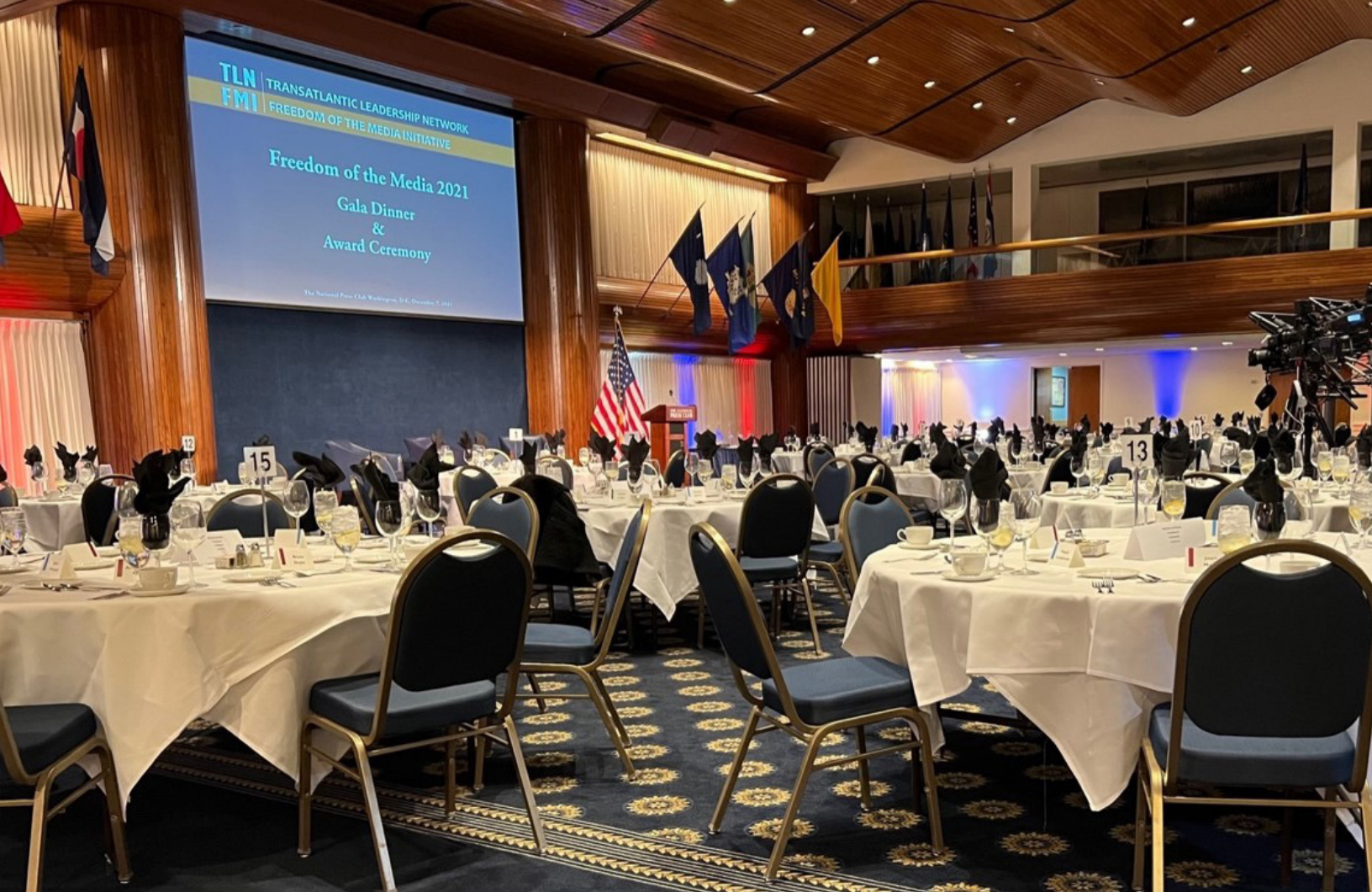
Transatlantic Leadership Network's Freedom of the Media Gala Dinner & Award Ceremony at The National Press Club, Washington D.C., December 7, 2021.